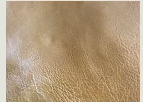
Natural Grain Variations